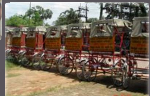
Rickshaw Bank / CRD