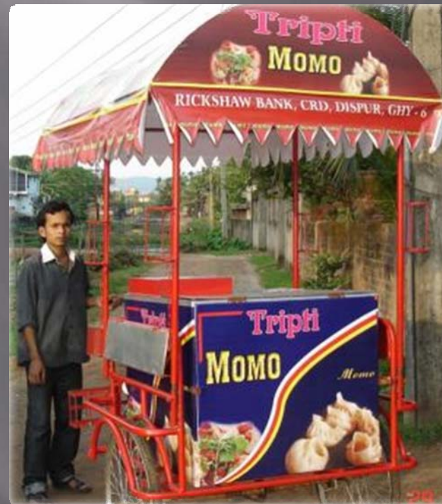
Rickshaw Bank / CRD